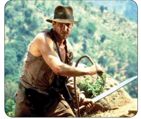
1230. Harrison Ford “Indiana Jones” stunt bullwhip from Indiana Jones and the Temple of Doom . (Paramount, 1989) Vintage original iconic bullwhip constructed of hand-woven strands of kangaroo hide wrapped to a solid handle and pommel, the whip measures approx. 10 ft. in total length, including the 6 in. leather loop affixed to the back of the handle. A character trademark, “Indy’s” use of the whip enabled him to fend off bad guys as well as to swing out of tight spots by using it as an acrobatic tether. It is the adventurer’s faithful sidekick and weapon of choice and one of the most highly recognized pieces in modern film history. This leather bullwhip measures 10 ft. long (from the butt of the handle to the end of the braid) and was used in stunt sequences throughout the filming of Indiana Jones and the Temple of Doom . An ever-present and integral component of the Indiana Jones mythology. Exhibiting production use and wear, but remains tight and intact. In vintage very good condition. Provenance: PIH Auction 56B (Dreier Part II), Lot 235. $15,000 - $20,000