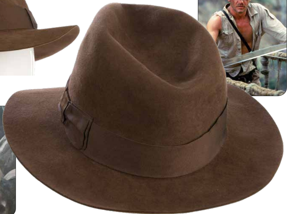
1231. Harrison Ford “Indiana Jones” signature screen-matched fedora hat from Indiana Jones and the Temple of Doom . Original iconic fedora hat worn by Harrison Ford as the legendary archaeologist/adventurer, Indiana Jones. Hand made of brown rabbit felt, the hat features a dark brown ribbon and brown leather interior hatband stamped in gold with block initials “IJ” and with hat maker Herbert Johnson’s company name and address in London. In the second installment of the immensely popular Indiana Jones franchise, the unique folds on the hat’s ribbon screen-match the hat worn by Indy as he approaches the shrine in the impoverished Indian village from which the Sankara stone was stolen. The hat was originally obtained from a former employee of hat maker Herbert Johnson and comes with a signed LOA. The hat was signed by Harrison Ford in silver ink on the interior leather hatband at a 2009 charity event. Included is a photo of Ford with the hat at the event. An extraordinary artifact that is instantly recognizable and synonymous with perhaps the greatest and most beloved character of the silver screen. In 2018 a screen-matching Indiana Jones fedora from Raiders of the Lost Ark sold for an astounding $413,000! $15,000 - $20,000